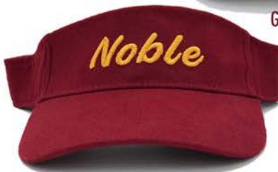
Golf Visor NOBLE