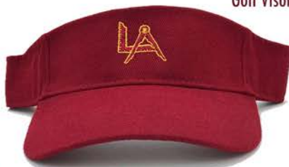
Golf Visor LA