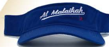
Golf Visor AM Blue