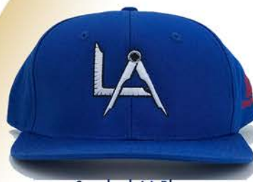
Snapback LA Blue