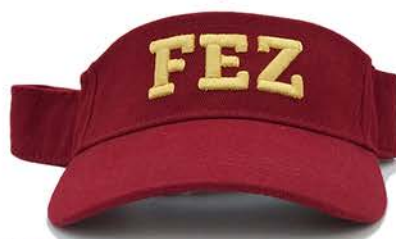
Golf Visor FEZ