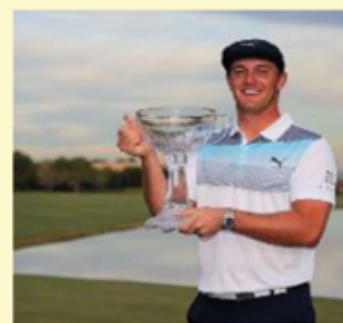
2018 PGA Winner

We are asking for YOUR Support and to Recruit: Al Malaikah Shriners, Shriners Ladies, Masons, Family & Friends with interest.