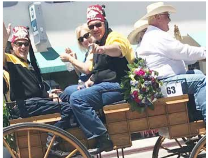
Al Malaikah Potentate Shows the Fez in Santa Barbara

All along the main parade route State Street, where the carriages, walkers and riders are very close to the spectators, jovial words are often exchanged between those in the parade and those on the sidelines. Much of it starts with the famous vocal cry “Viva la Fiesta!”, and many yell “Hey, Shriners, Shriners!”