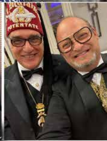
Al Malaikah Potentate's Gala