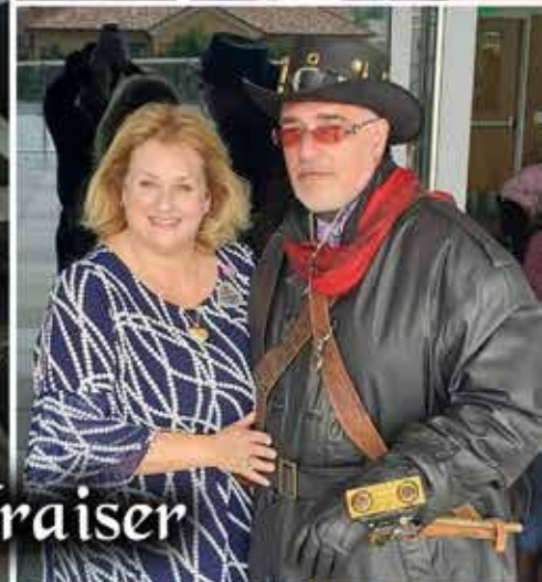
Daughters Of the Nile Fundraiser