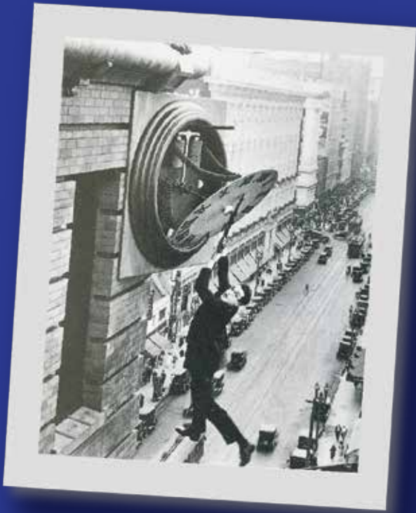
Silent screen star Harold Lloyd ( Past Potentate of Al Malaikah and Past Imperial Potentate ) in his 1923 film "Safety Last!"