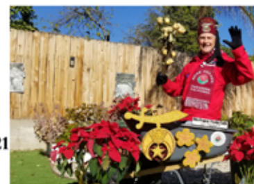
"Official" Unofficial 2021 Tournament of Roses Parade - Shriners Hospital Float... HAPPY NEW YEAR!