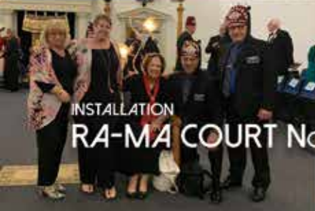
INSTALLATION RA-MA COURT No. 95 LOS