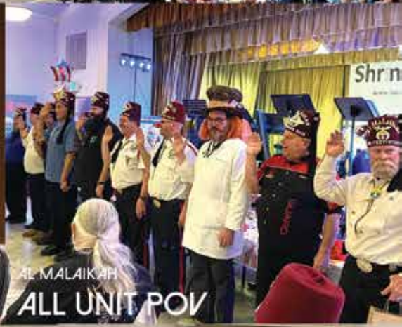
AL MALAIKAH ALL UNIT POV