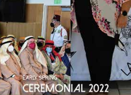
EARLY SPRING CEREMONIAL 2022