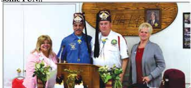
POV Kern County and Lake Isabella Shrine Clubs March 20th 2022

I would like to thank ALL those Nobles and Ladies that volunteered their time, effort, and knowledge who participated in "Making a Difference Together" in the first three months of the year, you know who you are. There's much more to do as we continue, so I ask you to come out and join us in our ongoing effort in "Making a Difference Together", Let's break out and have some FUN!!