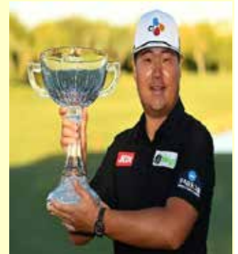
2022 PGA Winner

Volunteers are needed to fill the Marshaling Team for the 2023 Shriners Children's FED EX Golf Open At the PGA Golf Tournament at TPC SUMMERLIN In Las Vegas, OCTOBER 12-15, 2023