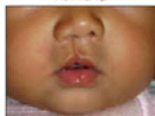
Microform cleft lip