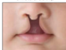
Bilateral cleft lip